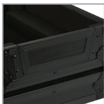
Removable case lid

We, at UDG have further fine-tuned already a great design concept of our flight case into one specially for the most discerning DJ/producer. Constructed from solid 9mm thick plywood, the outside is laminated in a black finished honeycomb/hexagonal "Stage Grip" pattern. The inner sides are protected with high density diamond embossed EVA foam protective padding. This is extremely robust padding protects the equipment against scratches, dust or other damages, creating a unique stylish & practical finish.