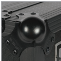
Heavy and powerful Steel Ball corners