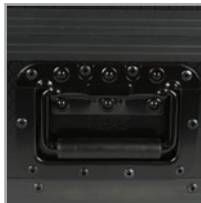
UDG spring-loaded handles