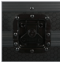
Recessed Butterfly Twist latch lock