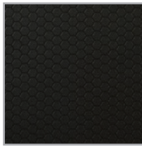
Laminated in a black finish with a honeycomb/hexagonal "Stage Grip" pattern