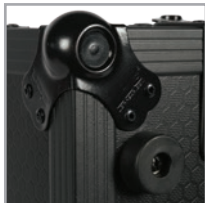
Industrial strength rubber feet at the bottom