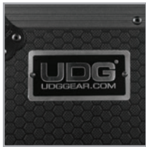
High grade aluminium UDG logo plate