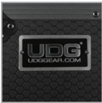
High grade aluminium UDG logo plate