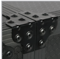
Extra-wide black solid aluminum profiles