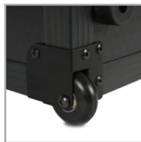
Built-in corner wheels on one side for convenient transport