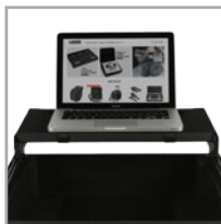
An extra notebook shelf included for your notebook