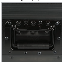
UDG spring-loaded handles