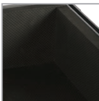
High density diamond embossed EVA foam protective padding