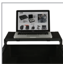
An extra notebook shelf included for your notebook