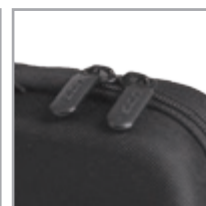
Easy grip zipper pulls