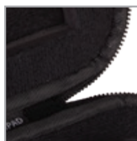
Durashock molded EVA foam