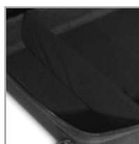
Removable padding divider