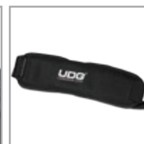
Convenient shoulder strap