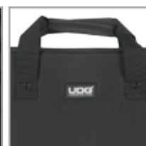
Convenient carry handles