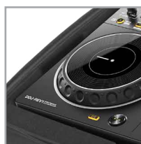
Skilfully moulded to fit Pioneer DDJ-REV1