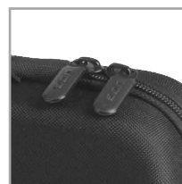
Easy grip zipper pulls