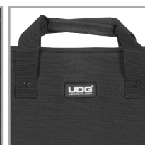
Convenient carry handles