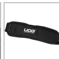
Convenient shoulder strap