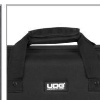
Convenient carry handles