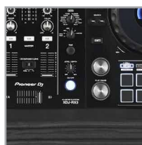
Skilfully moulded to fit the Pioneer XDJ-RX3