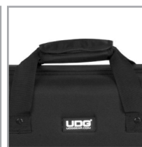
Convenient carry handles