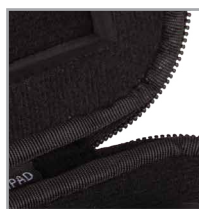
Durashock molded EVA foam