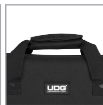
Convenient carry handles